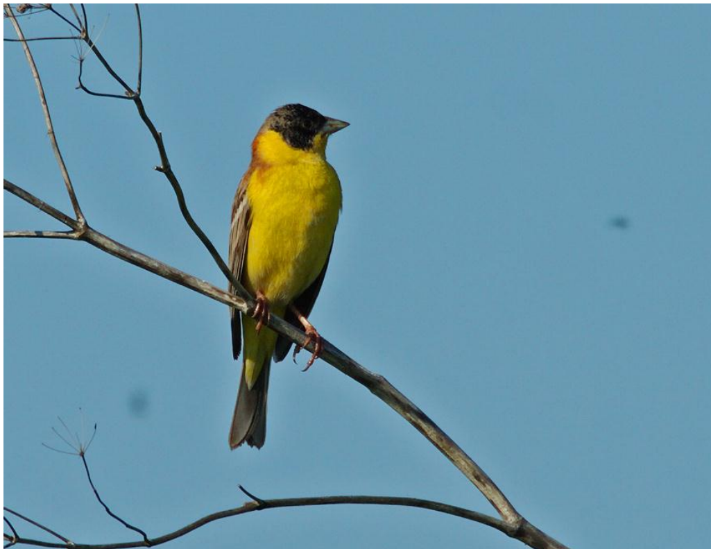
Picture 3. The black-headed bunting is a common species in the younger shelterbelts

The younger shelterbelts (up to 20 years old) were less diverse in species. In such habitat the main species were corn bunting ( Miliaria calandra ) and black-headed bunting ( Emberiza melanocephala ).