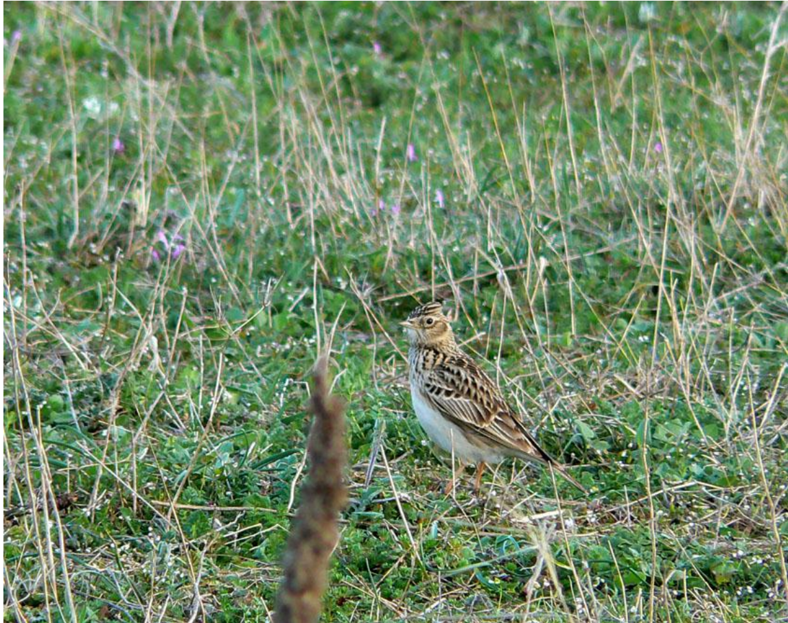
Picture 1. Skylark is the most numerous breeding species in SNWF