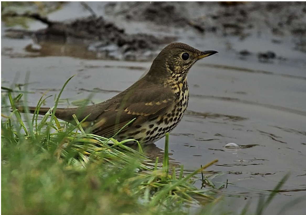
Picture 4. A juvenile song thrush ( Turdus philomelos ): this species nests in relatively low numbers in shelterbelts.

The older (40 - 50 years old) shelterbelts were characterized by lesser grey shrike ( Lanius minor ), golden oriole ( Oriolus oriolus ) and Spanish sparrows ( Passer hispaniolensis ) as common species. The relatively higher diversity of vegetation in the older shelterbelts is also apparently preferred by red-backed shrikes ( Lanius collurio ), nightingales ( Luscinia megarinchos ), magpies ( Pica pica ), blackbirds ( Turdus merula ), and starlings ( Sturnus vulgaris ), as well as birds of prey hunting in the territory. The overall breeding density and species diversity were both substantially higher than in the younger shelterbelts.