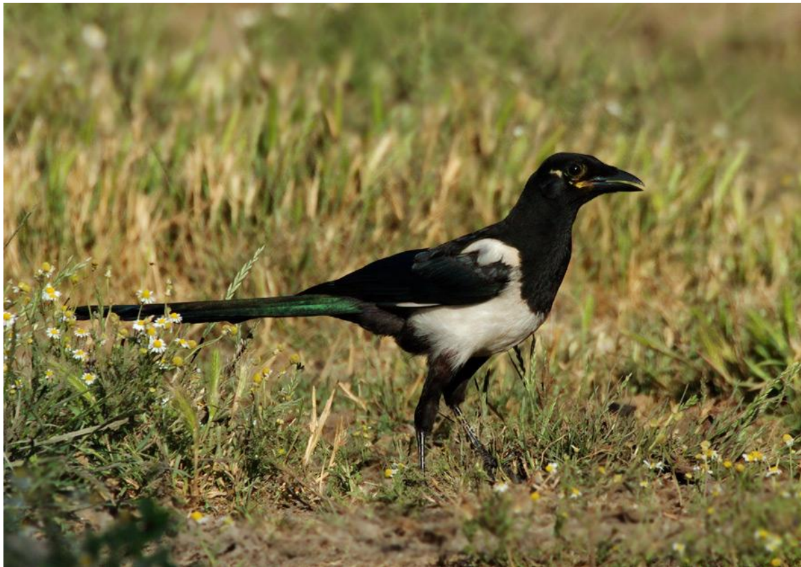
Picture 2. The magpie is a common species in the shelterbelts

The rest of the species belong to the following orders: 2 Columbiformes, 1 Caprimulgiformes, 1 Cuculiformes, 1 Piciformes, 1 Galliformes and Strigiformes.