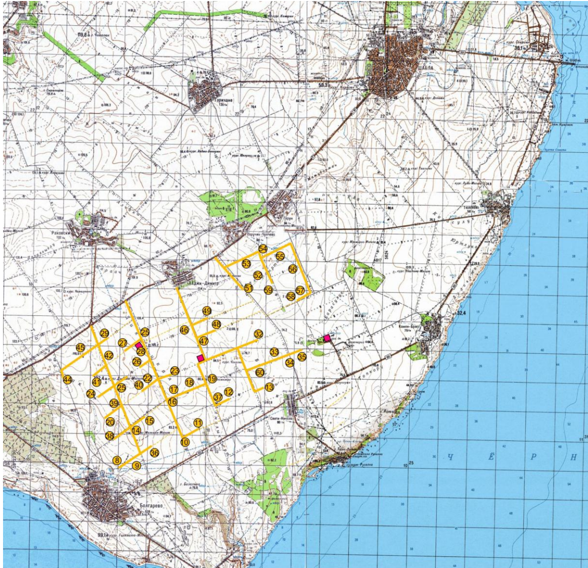
Figure 1. Location of SNWF with indicated number and locations of turbines. The transect routing followed the road connections of all 52 turbines.