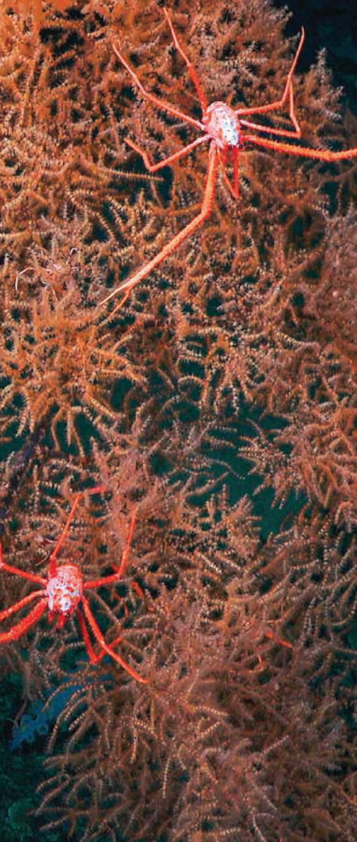
Squat lobsters are on a Leiopathes sp. black coral on a seamount off the Pacific Coast of Costa Rica.

ferent OBCI methods under consideration. Natural removal of photosynthetically fixed carbon to depths below 1000 m for varied amounts of time (through mixing, sinking, aggregation, and vertically migrating animals) is considered sequestration. Ocean fertilization (OF) and macroalgal culture and sinking [afforestation (AF)] seek to enhance natural processes of marine photosynthetic uptake of carbon and removal to depth. OF adds limiting nutrients to stimulate carbon capture by phytoplankton that will sink, sequestering carbon to the deep sea (2). AF acts by culturing massive amounts of seaweed and sinking them to deep waters (1). Deep-sea disposal of terrestrial crop waste is under consideration, and expansion of coastal blue carbon as wetlands or macroalgae will also introduce OM to the deep sea.