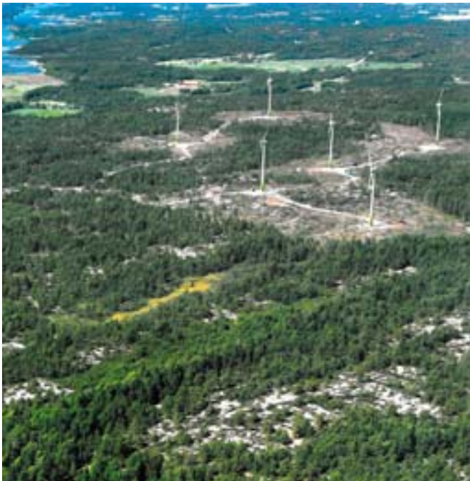
Wind power in rocky terrain in western Sweden.