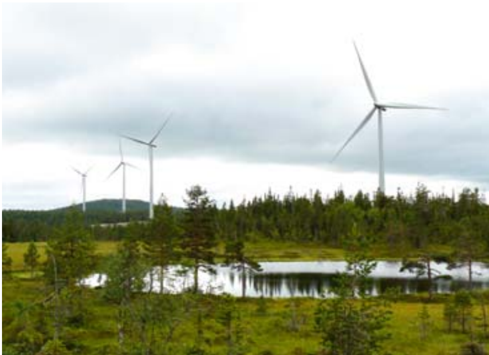
Wind power at Kyrkberget in Mid-Sweden.

As it is well known that mammals can be affected by various types of human disturbance and exploitation, it is reasonable that also wind power has effects. With the increasing expansion of onshore wind power, the question of effects on terrestrial mammals is increasingly brought up by hunters, conservationists, and not least reindeer husbandry. Wind power planning will increasingly include management issues relating to large carnivores, moose and other larger wildlife, and in all wind power development within the reindeer husbandry area, the impacts on reindeer and reindeer herding are important issues. A knowledge basis is needed to support the necessary trade-offs between interests.