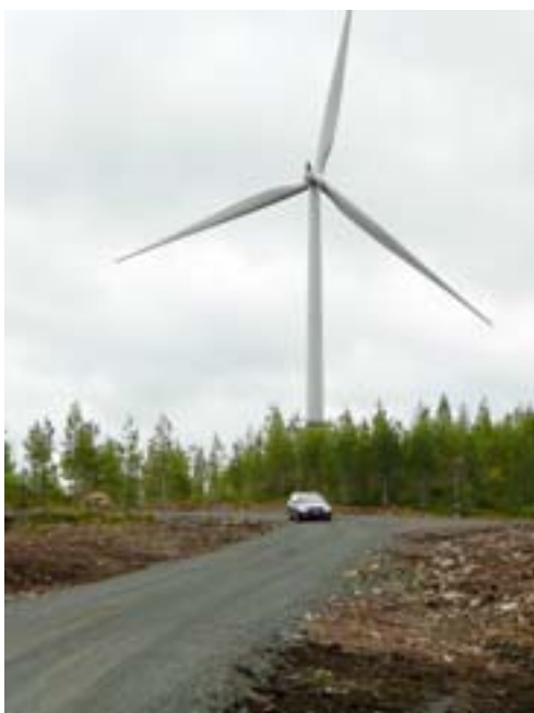
In most wind farms, roads are open for all traffic. The wind farm at Kyrkberget, Sweden.