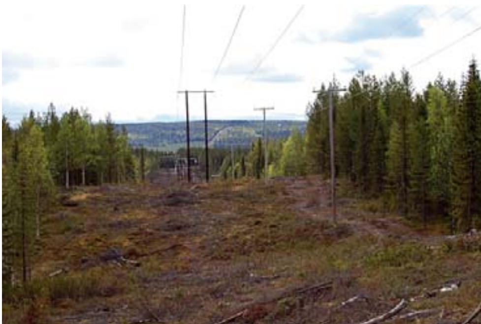
New power line at Jokkmokkliden wind farm in northern Sweden. Another new power line, for Storliden wind farm, is visible in the background.

Other studies indicate no such avoidance. Reimers et al. (2007) could not find that wild reindeer avoided the area around a power line. In this study, however, only reindeer within 3 km from the power line was studied, while other studies have noted that reindeer avoid a zone up to 4 km away from major power lines, and instead choose to reside in areas 4–10 km away from power lines (Nellemann et al. 2001, Vistnes & Nellemann 2001, Vistnes et al. 2004). A more recent study on reindeer habitat choice within 5 km of a transmission line showed that they did not avoid the area around the power line (Bergmo 2011). Local studies of reindeer behaviour in the vicinity of power lines