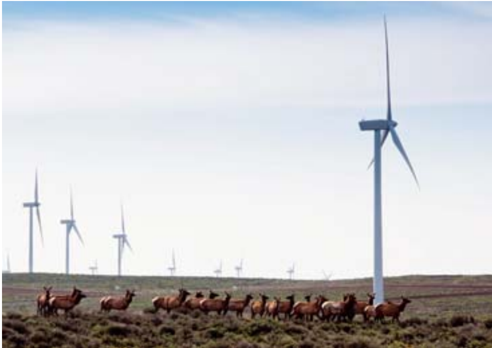
North American elk at a wind farm in Washington State, USA.

The Norwegian project VindRein, that has been running since 2005, identifies how reindeer are affected by wind farms in open terrain such as mountain areas and along the Norwegian coast. Preliminary results from the project show that the reindeer avoided wind farms during construction but that they subsequently came back to graze within the wind farms (Colman et al. 2008). It should be emphasised though, that during the expansion of large wind farms, the construction phase extends over several years, and some effects during this phase can thus be long-lasting (at least along the main access roads).