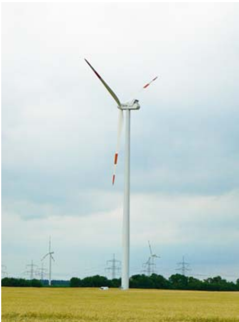
Wind farm near Cottbus, Germany.

In a Finnish study of domestic reindeer on a regional scale, the reindeer's choice of home range and grazing area within the home range was studied (Anttonen et al. 2010). In this study, reindeer avoided areas with major roads, but not areas with minor forest roads, presumably due to the low activity on the latter road type. The Norwegian VindRein project showed that domestic reindeer who returned to a wind farm area after the construction phase was completed still avoided the access roads into the area (Colman et al. 2008).