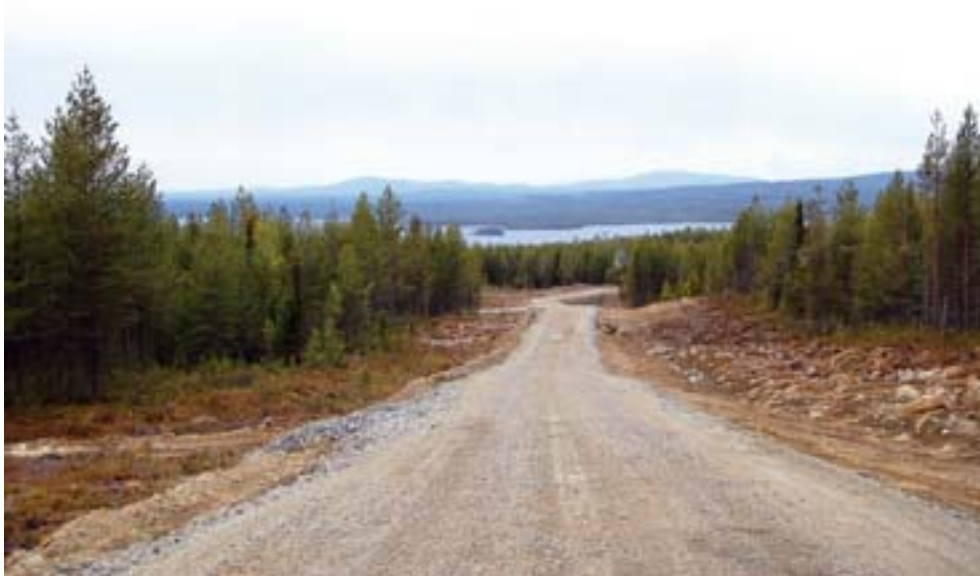
New road in Storliden wind park in northern Sweden.

To further provide food and shelter for herbivores, one could choose to manage available land along roads and power lines in wind farms to promote the growth of shrubs and herbs and create diverse forest edge habitats. Such management could have a significant contribution to ungulate forage, and may decrease the grazing pressure in the surrounding woodland (assuming that ungulate populations are regulated through hunting). In this context, however, there is reason for caution that areas rich in small mammals, carrion of large herbivores, etc. can attract birds of prey, which in turn run the risk of being killed by wind turbines.