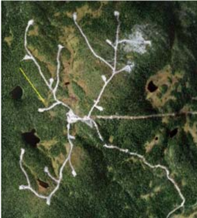
The wind farm at Bliekevare, Västerbotten county, Sweden, where ca 9 km new road has been constructed, and the average width of the road area is 21 m (Rönnqvist 2011). A 500 m line (yellow) is inserted in the picture for scaling. At the time of the image the wind farm is under construction. From Google Earth.