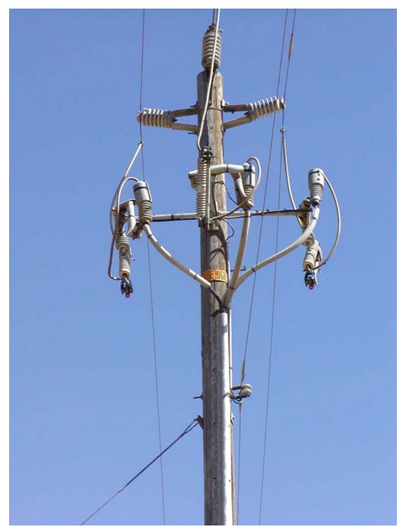
Figure 3. Illustration of a retro-fitted riser pole.