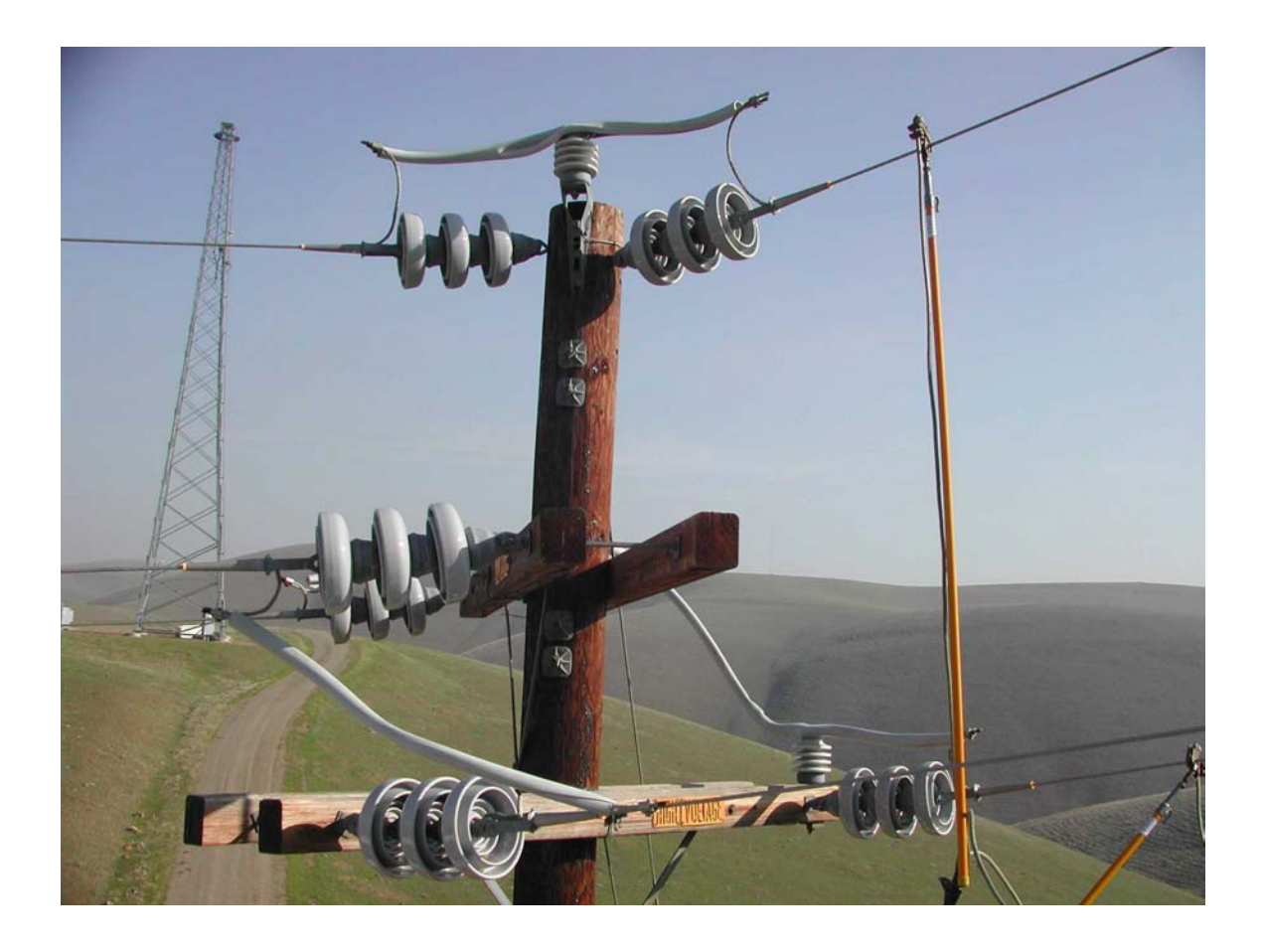
Figure 4. Typical corner pole with insulated wires.