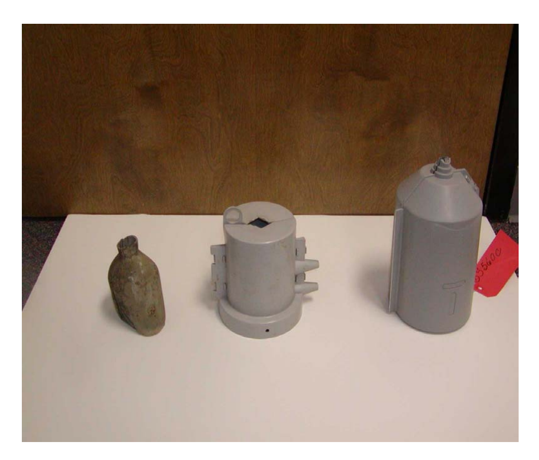
Figure 2. Chronological order of wildlife boots used to protect birds from electrocution on riser poles